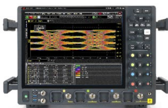
1.85 mm input models