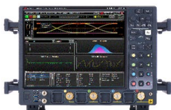
1 mm input models

The UXR is available in three models based on bandwidth, sample rate and input connector size. Infiniium UXR-Series models offer bandwidths from 5 GHz to 110 GHz with various 1-channel, 2-channel, or 4-channel configurations available. The 3.5mm models are equipped with Keysight AutoProbe II interfaces while 1mm and 1.85 mm models incorporate an advanced high-performance high-bandwidth Keysight AutoProbe III interface.