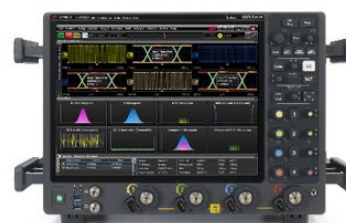
3.5 mm input models